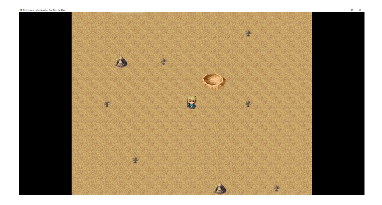
Download ->>> <a href="http://bit.ly/2HW8Hsl">http://bit.ly/2HW8Hsl</a>